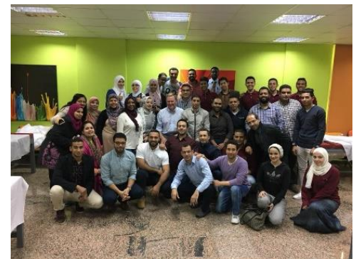
Cervical Manipulation Post Conference Workshop Participants