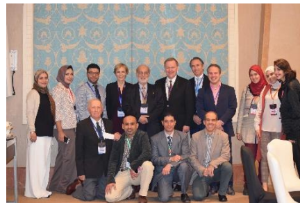
The OMTA organizing committee and keynote speakers in Cairo

seem to have so many political forces trying to create fear and separation by advocating to “build a wall” and to “Brexit”. When I first considered traveling to Egypt, I was not sure what to expect.