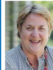
IFOMPT Webinar – The Ethical Side of Manual Therapy

The April 2021 webinar will be presented by Dr Ina Diener from South Africa and the recipient of the 2020 IFOMPT Maitland Award. The webinar will cover “The Ethical Side of Manual Therapy”